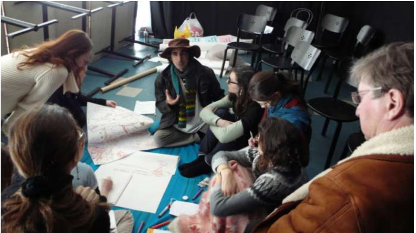
Above, and Right: Photos taken during the Art of Hosting events, held in Karlskrona Feb. 2010.

participants learn about these methodologies but are also encouraged to put them into practice by hosting sessions during the four-day training. Harvesting, or documenting the conversations, is emphasized as critical to capture the essence of what happened and encourage action to follow.