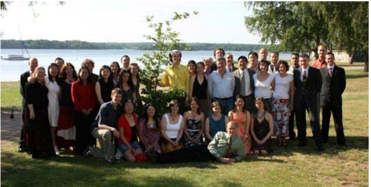
Congratulations to the Class of 2007, shown here standing next to the MSLS Tree planted by the Class of 2005.