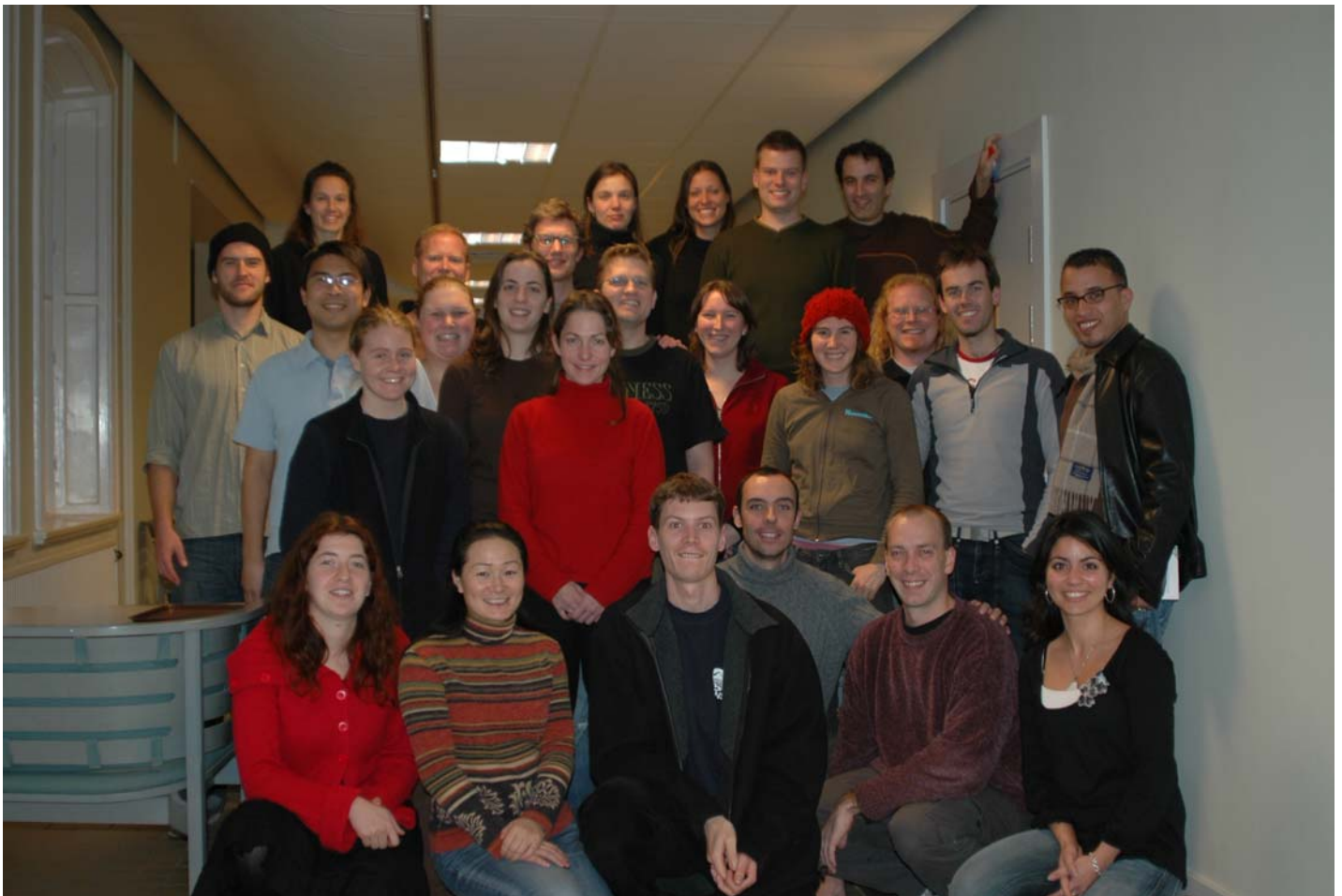
Three generations of MSLS classes meeting together in Karlskrona for an MSLS visioning session.